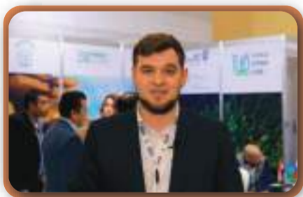
EXPORT SUPPORT CENTER OF THE FUND "MY BUSINESS"

Thank you very much for being here at the Cairo WoodShow , we're very happy as a company, Valasaha to take part. It's been quite interesting, we've met a lot of interesting partners for projects, distribution, and importers, and we're happy to be here. We see North Africa and especially Egypt as a great potential market, it has been always a traditional market and we're happy to be here and we look forward to seeing opportunities and growing our business here locally.